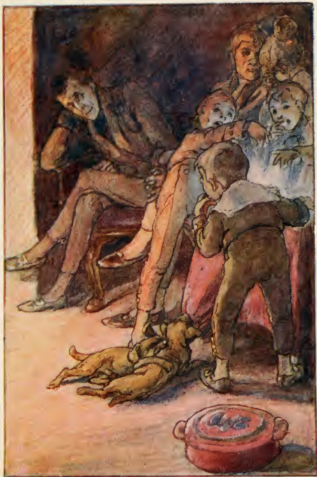
MacGreedy swallowed the raisin with a start (p. 119).